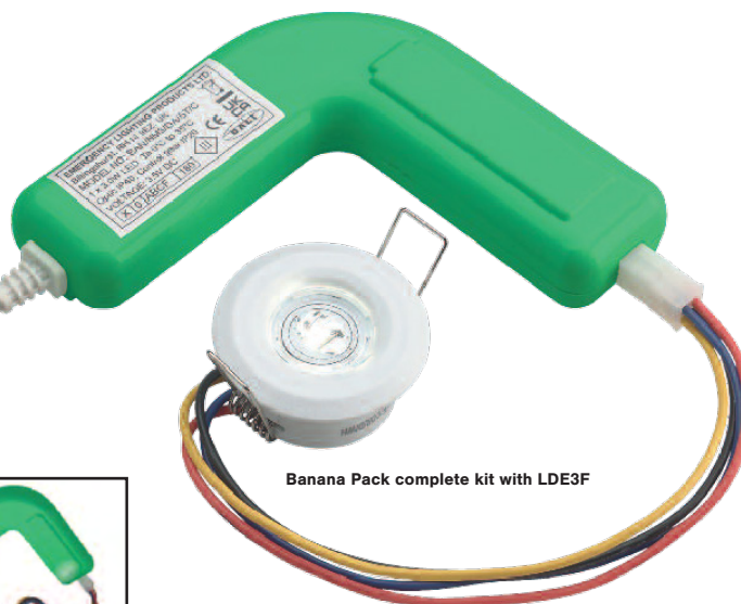
Banana Pack complete kit with LDE3F