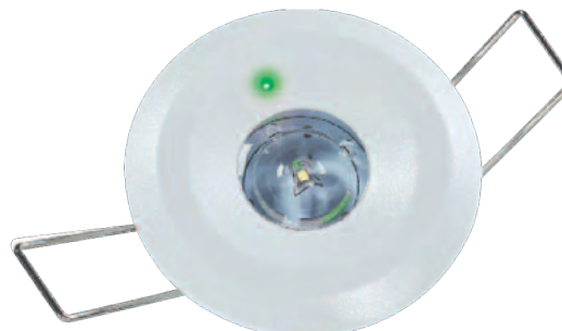
LDE3F/WID/D/WH White Downlight