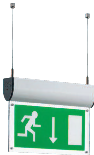
SLD/M3/SL/ECAD + SLD/WSK