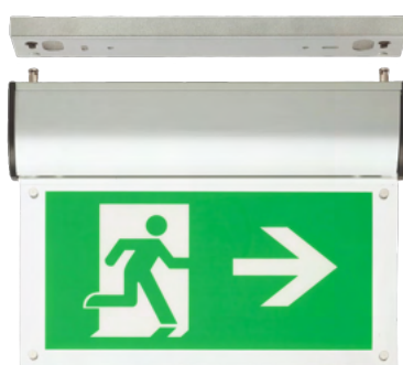
SLD/M3/SL/ISOAL-R + SLD/CBRK/SL