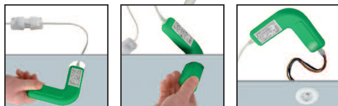
Banana Pack rolls neatly through 45mm diameter ceiling tile cut-out.