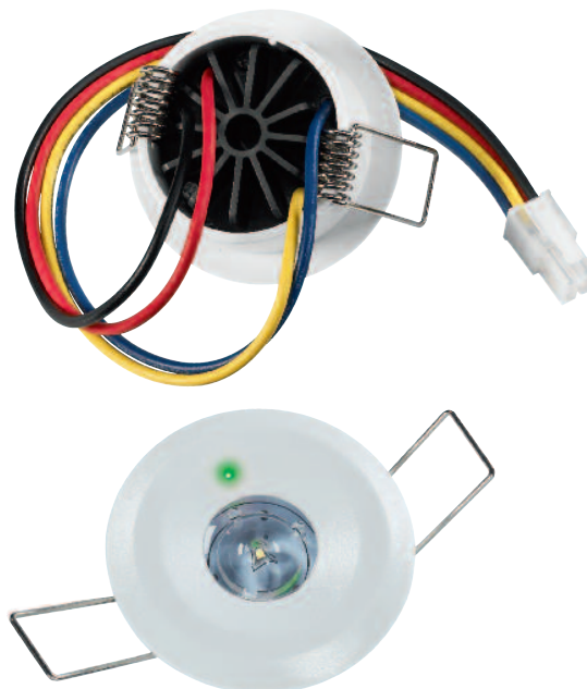
LDE3F Downlight (also available in Black)