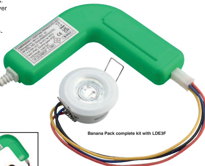
Banana Pack complete kit with LDE3F

NOTE: Banana Pack with LDE3F downlights can be equipped with SurePath BLE Bluetooth addressable Gateway modules. See Data Sheet .