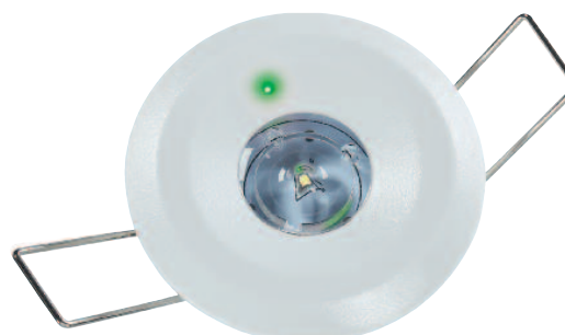
LDE3F/WIDE/WH White Downlight