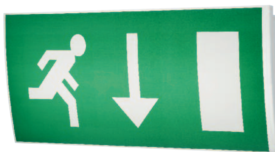
EC Signs Directive format