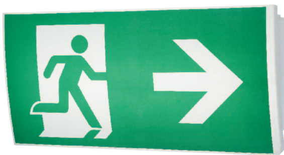
ISO sign format