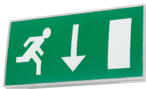
EC Signs Directive format