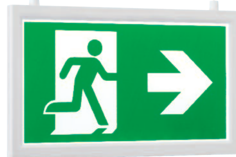
MXL/ESA09 and MXL/ESA11