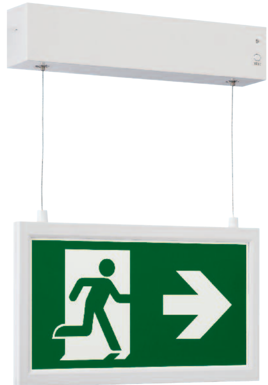
MXL/ESA09/LFP (small) MXL/ESA11/LFP (large)