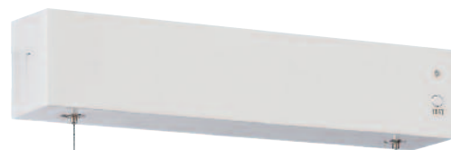
Adjustable suspension wire Length: 15mm to 1metre