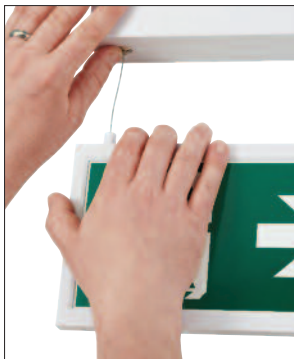
Simple height adjustment