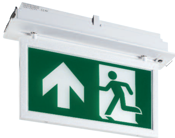
MXL/ESA11/LFP/RB (using /RB recessing accessory)

This feature is ideal for applications requiring a more aesthetic installation.