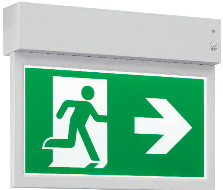
MXL/ESA08 and MXL/ESA10