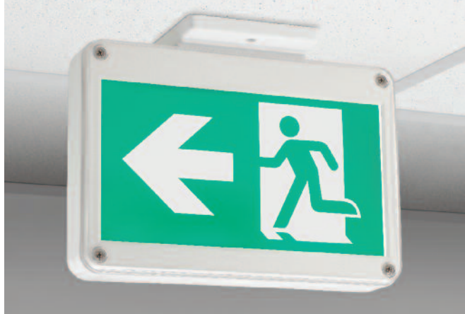
Every Manta sign is provided with a retro fittable second legend plate for ceiling or 'flagpost' wall mounted double sided installation.