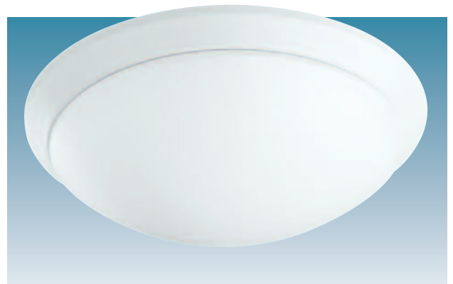
XL400/230 Standard base