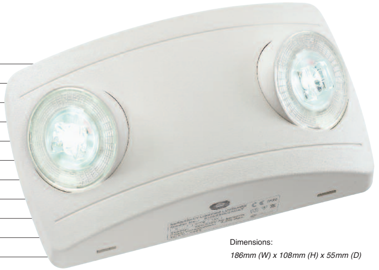
Dimensions: 186mm (W) x 108mm (H) x 55mm (D)