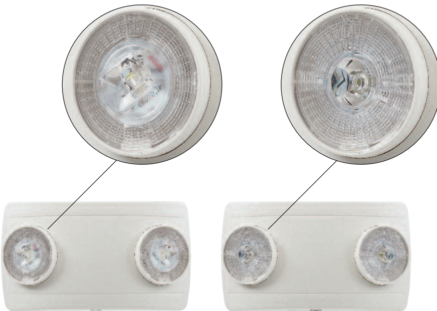
MiniTS/600N/M3 — Narrow Angle Spot