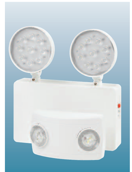
Relative Scale: MiniTS/600/M3 to ELP TLD/NM3